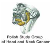
Polish Study Group of Head and Neck Cancer