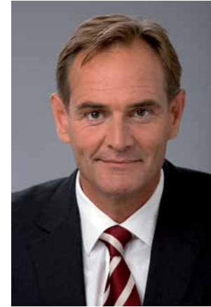
Mayor City of Leipzig Burkhard Jung

Ladies and Gentlemen, Dear medical doctors and scientists,